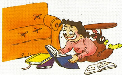
looked at her photo collection six weeks ago (six months ago)