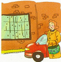
parked in the road yesterday (last week)