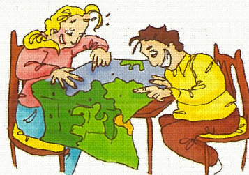
discussed the trip a year ago (last winter)