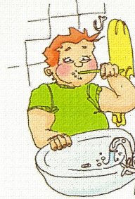
cleaned his teeth after breakfast (before breakfast)