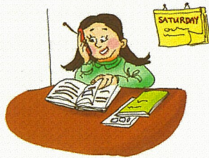
called her parents at the weekend (on Monday)