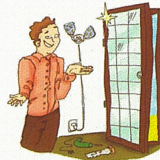
finished the job three weeks ago (last month)